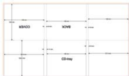
Digipack 6-panels.tif 420K