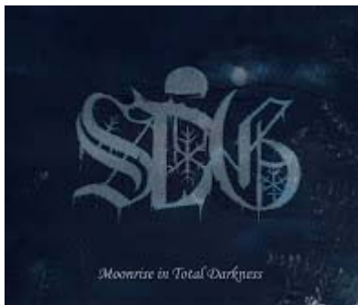
SDG-Moonrise in Total Darkness new cover 2016.jpg